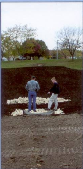
Application of compost to a storm water basin improves water holding capacity and infiltration.