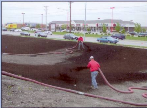
Compost seeding being applied to a commercial site.

Amended soils will help restore soil functions, decrease storm water runoff and erosion, and save on watering, fertilizer and pesticide usage.