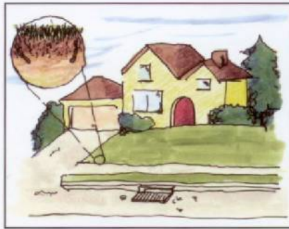
compost on the lawn | a close look

Compost-amended soils are also better at breaking down or filtering pollutants — such as hydrocarbons and heavy metals from cars, pesticides or soluble fertilizers. Finally, compost can reduce maintenance costs by improving soil moisture retention and plant rooting depth, reducing the need for irrigation.